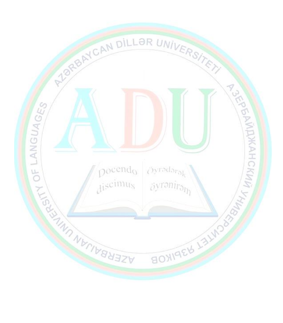
Baku - 2021